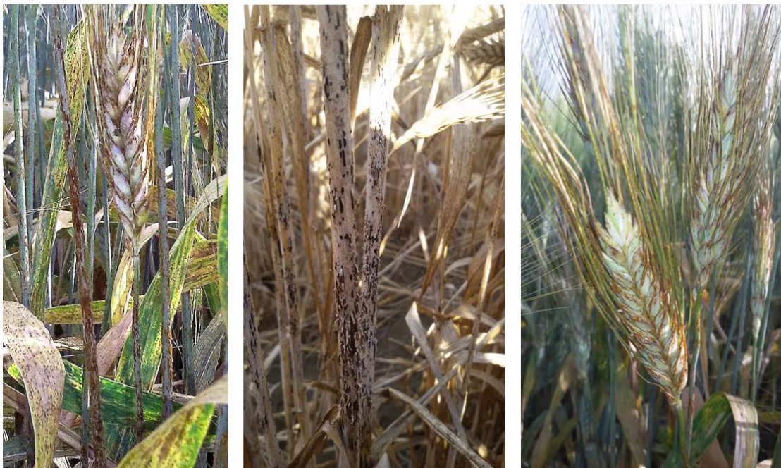
Figure 1: Heavily infected fields of commercial durum wheat, Sicily May 2016

Results of extensive lab tests of samples of stem rust have shown that the 2016 stem rust epidemics in Sicily were caused by a new, highly virulent variant of race TTTTF. The samples were collected during serious and unusual outbreaks of wheat stem rust on both durum wheat and bread wheat in Sicily during April - June 2016.